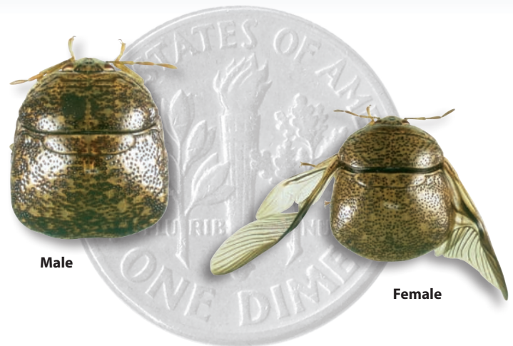
Fig. 2. Adult Megacopta cribraria are 4 to 6 mm long, oblong, olive-green colored, and produce a mildly offensive odor when disturbed.

inactivity to resume their normal life cycle. In Georgia, M. cribraria 's presence was detected for the first time when large numbers exhibited this overwintering behavior in response to declining temperatures in north Georgia. The insects moved from nearby kudzu patches onto the warm, sunlit south and east exposures of nearby homes. They especially gravitated towards light-colored surfaces (Fig. 3).