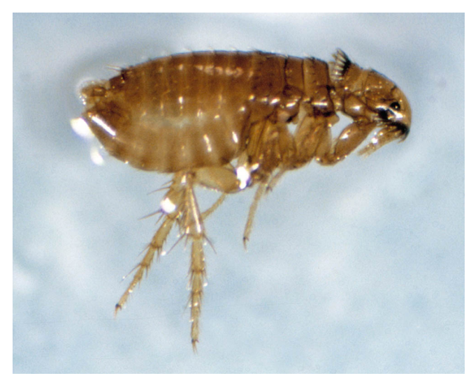
Figure 3. Cat flea adult.

(double their unfed size). Under magnification they can be seen to have both genal and pronotal combs (ctenidia), differentiating them from most other fleas of domestic animals.