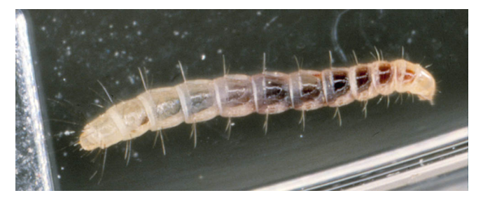
Figure 2. Cat flea larva.