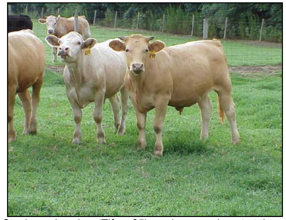
Stocker calves in a 'Tifton 85' grazing experiment at the CPES in Tifton, GA.

The most recent cultivar to be released from the CPES breeding program, 'Tifton 85' is the best bermudagrass cultivar since 'Coastal.' 'Tifton 85' is a sterile hybrid between a winterhardy bermudagrass introduction and a highly digestible cultivar, 'Tifton 68,' that had been developed from two different lines of stargrass (a different species within the same family as bermudagrass). When grown as a hay crop, 'Tifton 85' produces up to two-thirds more forage per acre than 'Coastal.' Interestingly, when they analyzed the forage quality in their lab, they noticed that 'Tifton 85' had higher levels of fiber (NDF and ADF) than 'Coastal.' However, the digestibility of the fiber was much higher in the 'Tifton 85' than the 'Coastal' and, consequently, the 'Tifton 85' was actually found to be much more digestible than 'Coastal.'