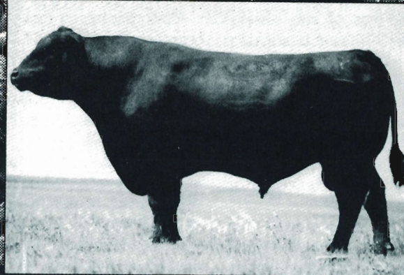
14AN092 G D A R 10989617 OSCAR 711