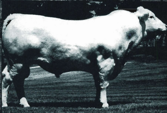
14CH101 HCR M252884 FLASH 5074 Homozygous Polled