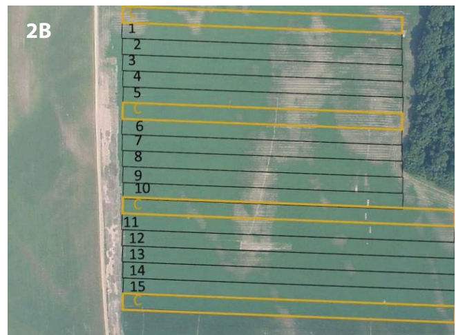
Figures 2A-B. Unreplicated strip plots.