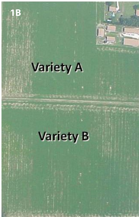
Figures 1A-B. Two examples of how split-field comparisons could be conducted.