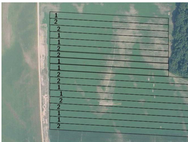
Figure 3. Example of a head-to-head or split-planter comparison of two varieties.

Head-to-head comparisons are often conducted by splitting the planter or drill with one variety in each half (figure 3). Because the two varieties always occur in the same pattern, the randomization scheme does not necessarily meet scientific requirements. This is not a major issue, especially if at least four or more replications are used. “Randomization” means that each variety is placed in the field at random and that each has an equal probability of occurring next to another. When we split the planter, we know, for example, that variety 1 will always be to the left of variety 2.