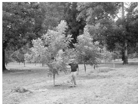
Fig. 1. Representative picture of remaining stump 7 years after tree removal, transplanted trees in their seventh growing season, and residual established tree.

Removal of established trees was based on criteria outlined by Goff and Browne (2004) resulting in a random pattern of established trees and stumps with young interplanted trees. The distances from the interplanted trees to the nearest stump and to the nearest established tree were not inversely related. For instance, in some cases, a single tree was removed; thus, the distance to the nearest stump might be in the row where the tree was removed but the nearest established tree might be in the adjacent row or the same row. If three adjacent trees were