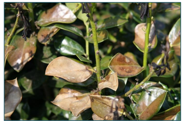
Freeze injury symptoms of bleached, necrotic foliage and split bark (seen at arrows) on boxwood (left), cast-iron plant (upper right) and holly (bottom right).