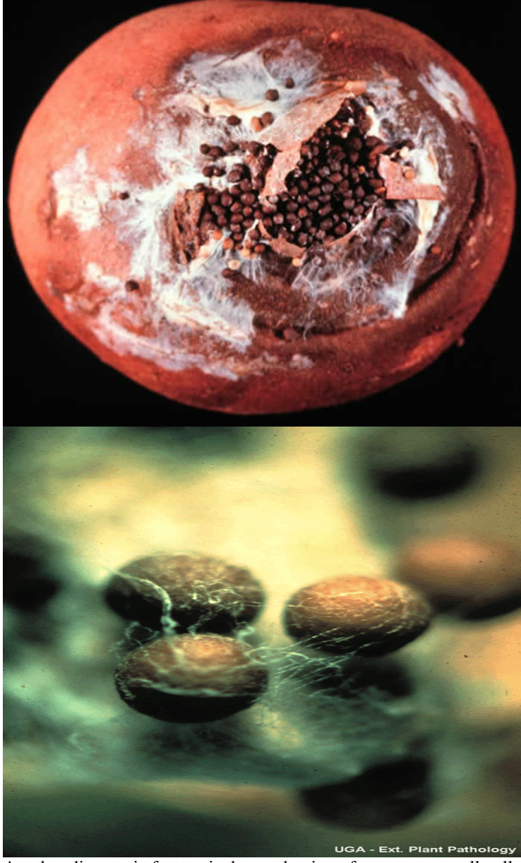
Another diagnostic feature is the production of numerous small yellow, tan, brown to black, hard sclerotia (survival structures) that resemble mustard seeds and are formed on the surface of infected tissue.