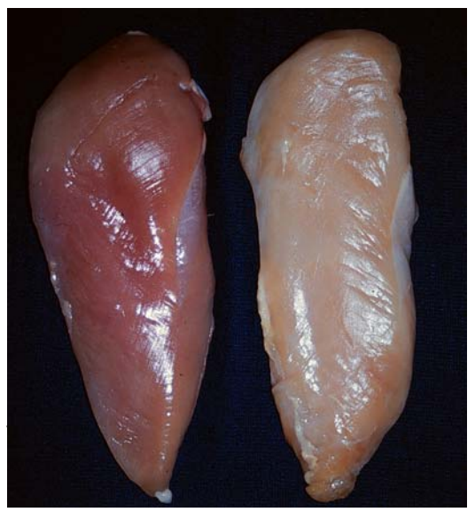
Figure 1: this photograph shows a dark and light breast fillet collected from a commercial processor.

Allen et al. (1997) stated that to resolve this problem, it may be advisable for poultry companies to sort breast fillets by color and route extremely light fillets to high volume outlets. For companies with extreme variability in breast color, sorting may be a viable option.