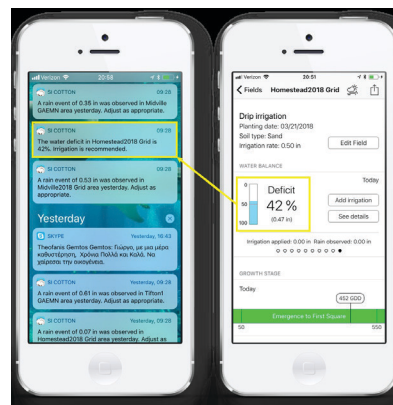
Screen shots from the SmartIrrigation Cotton App show notifications sent to the user (left) and the main app page that shows the moisture available in the soil profile (right).

example, over the past 5 years, the Cotton app has resulted in an average reduction of 44% in irrigation water use and an average 13% yield gain when compared to the UGA Extension calendar or checkbook method. More information is available at www.smartirrigationapps.org .