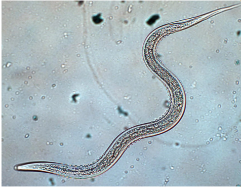
Figure 2: Beneficial nematode (USDA-ARS, Juan Morales)

In research conducted under our previously funded SARE grant as well as other related research we discovered that late summer and fall applications of the beneficial nematode, Steinernema carpocapsae , controls peachtree borer at the same level as chemical insecticides such as chlorpyrifos. In this approach, the nematodes are applied within the same timeframe as chemical insecticide application and can be sprayed using standard equipment including handgun, boom sprayer or trunk sprayer. In a curative approach, the nematodes can also be applied in applications in the spring to kill any remaining peachtree borers that were missed during summer/fall applications. This reduces damage to the trees and prevents a subsequent generation of peachtree borers from emerging and reproducing. Although the curative approach is highly effective when using beneficial nematodes, it is not an effective approach when using chlorpyrifos. The nematodes are applied at a rate of 1 million to 1.5 million per tree.