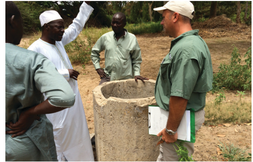
Looking at an old well in the Dakar region in Senegal to establish an irrigation system for production fields at a local school.