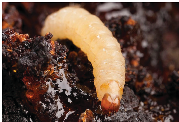
Figure 1: Peachtree borer larva

Peachtree borer, Synanthedon exitiosa (Fig. 1), is a major pest of peaches and other stone fruit trees in the southeast and throughout the USA. Currently, methods of control for peachtree borer include the use of broad spectrum chemical insecticides, primarily chlorpyrifos. Due to severe environmental and regulatory concerns alternative methods of control must be developed and their impact on cropping system assessed. Implementation of a targeted biocontrol strategy that positively impacts other aspects of the orchard system (such as overall plant health and suppression of plant diseases/plant-parasitic nematodes) could be a powerful approach in establishing sustainable orchard practices.