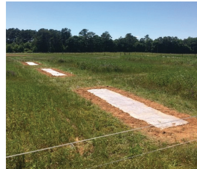
Biosolarization strips “sterilize” soils by preventing emergence of many annual weeds and controls soilborne pathogens and pests by increasing the soil temperatures to unfavorable levels for extended periods of time.

organisms (proteobacteria, actinomycetes, cyanobacteria, nitrospirae, acidobacter and firmicutes). This microbial diversity creates redundancy of function, which can provide plant nutrients under varied environmental conditions. We assumed this redundancy would result in agroecosystems that were more resilient and resistant to stress. We found LEM had the ability to improve resilience and stress resistance when used in low nutrient or disturbed ecosystems. For example, in biosolarized (“sterilized”) soils, LEM application improved kale yield and leaf nitrogen concentration in soils that received no fertilization.