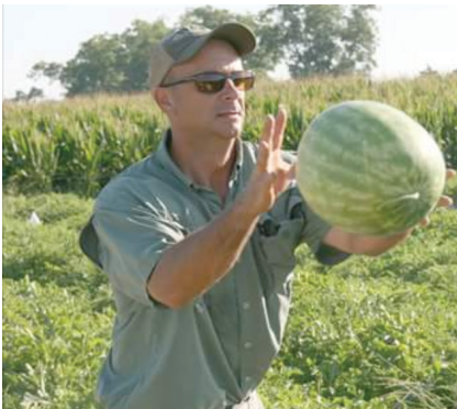
Harvesting watermelons in Tifton, GA.