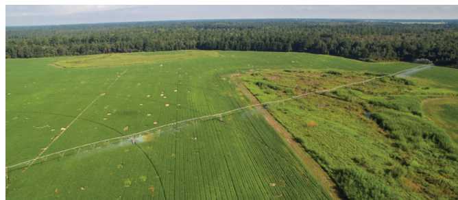
Dynamic VRI in action with the pivot delivering different water rates to the farmed area of the field. Note that the sprinklers are completely off over the non-farmed area which results in immediate water savings.

VRI allows center pivots to apply different amounts of irrigation water to individual irrigation management zones (IMZs) within a field to address the variability in soils and crop water needs that exists in most fields. The application rates are coded into an application or prescription map. Currently most prescription maps are static meaning that once they are developed and the IMZs assigned application rates, those same rates are used throughout the growing season and year after year. This process can be improved by using actual crop water requirements to determine the application rates each IMZ. We call this concept dynamic VRI.