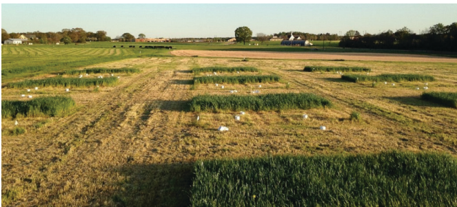
Research plots in the spring. Cereal rye cover crop can be seen here as the patches of green. CO 2 respiration chambers are installed in the previously mowed annual ryegrass plots.

Our lab has been conducting research at the Organic 2 research plots at the JPC Sr., Research and Education Center in Watkinsville, GA. We are looking at the impacts of LEM on soil health, crop productivity, and nutrient density across a range of crops, fertilizers, and cropping systems. We collect data on the soil microbial communities, nutrient cycling in the soil, plant yields and crop nutrient density.