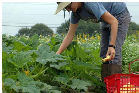
Small farms have unique loan needs given their farm business environments.

A University of Georgia study funded by SARE was conducted in 2011 to understand the organic farmers’ reluctance to avail of regular farm loans and probe deeper into the nature of their relationship with farm lenders. Specifically, the study sought to obtain the organic farmers’ opinions and concerns on credit access and the farm lenders’ attitudes or perceptions of organic farming operations that may have influenced borrower-lender relationships.