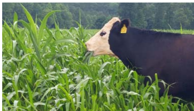
Four different warm season annual forages will be tested to see which is the most effective at producing grass-finished beef.

The mild climate and long growing season of Georgia makes it an ideal location for grass-finishing beef. However, the system is not as simple as just growing and grazing grass. The forage must be both highly digestible and nutritious in order for the animal to rapidly lay down both fat and muscle. Although the use of cool season annuals and perennials provide high quality forages for finishing cattle during the fall, winter, and spring months, there are less forage options available for grass-finishing beef during the summer period. Typically, most beef