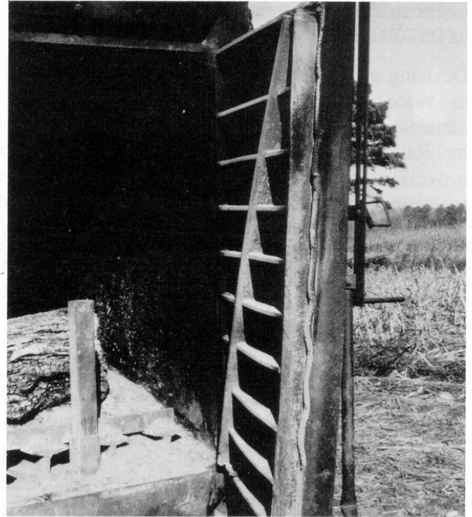
Figure 2. Doors must be water cooled to prevent the intense heat from warping them.

Experience has shown that this problem cannot be eliminated altogether, although it can be substantially