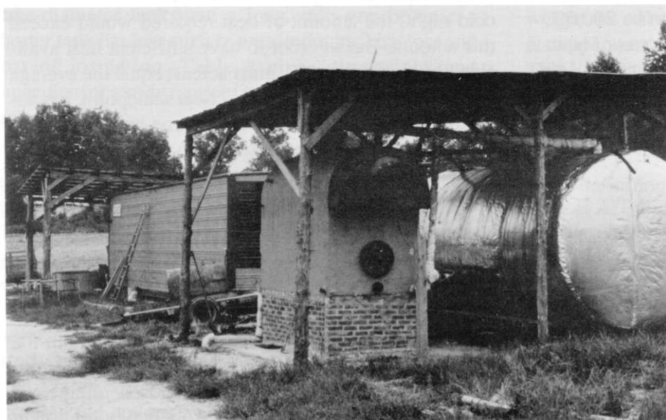
Figure 3. An additional tank will increase storage capacity.

If the heat storage capacity is inadequate, one solution is to add another tank. A tandem tank is normally