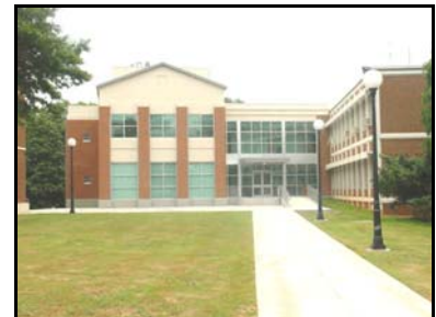
The Food Science Building (left wing) is the location for many Extension Food Science workshops.

The UGA Extension Food Science Outreach Program