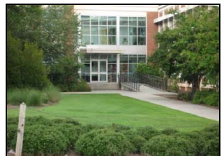
The Food Science Building (left wing) is the location for many Extension Food Science workshops.

316E/US 29S/US 78E/UNIVERSITY PARKWAY, get on Loop 10 North (across the overpass), then stay on Loop 10 for 2.5 miles. Take exit 11B for Downtown Athens/NORTH AVENUE and go right (south) on North Avenue for 1.2 miles. Go under the railroad overpass made famous by REM. Go around the bend and the next drive to the right is FOUNDRY PARK INN. Shuttle service to and from the Food Science Building will be provided for workshop participants. Ask for the schedule at check-in.