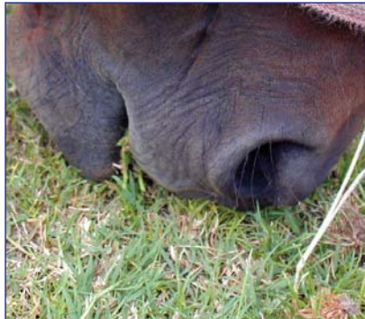
Horses can graze very closely. In this photo a horse grazes a bermudagrass sod too close.