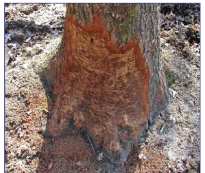
Trees must be fenced out to avoid girdling by horses. In this photo an unfenced tree has been fatally injured.

For more information on maintaining healthy horse pastures, contact your local Virginia Cooperative Extension Office or visit the Virginia Cooperative Extension website at http://www.ext.vt.edu/resources/ .