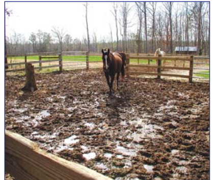
Sacrifice areas often become muddy and require the construction of a rock pad.