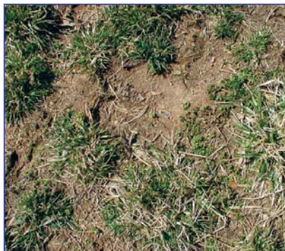
Close and frequent grazing weakened this sod, resulting in a pasture that is less productive and more susceptible to erosion and weed encroachment.