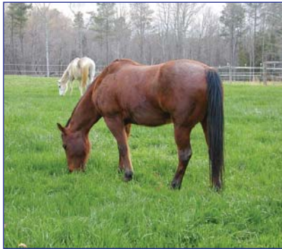
Well-maintained pastures can serve as an economical and high-quality feed source. Here a mature pleasure horse grazes contently in a field of annual ryegrass.