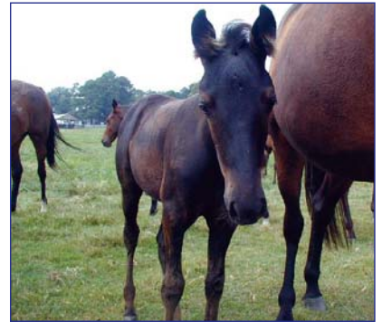
Healthy pasture sods supply a safe exercise surface for growing foals.

USE ELECTRIFIED POLYTAPE TO CONTROL GRAZING. For this type of fencing to be effective, it must be electrified at all times.