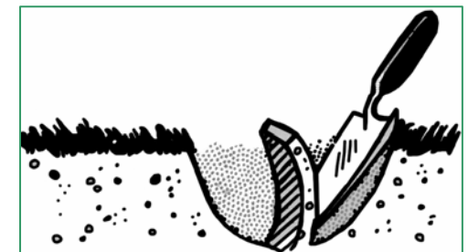
Figure 3. Soil sampling with a trowel.

Push the handle forward, with the spade still in the soil to make a wide opening. Then, as shown in Figure 3, cut a thin slice from the side of the opening that is of uniform thickness, approximately \frac{1}{4} inch thick and 2 inches in width, extending from the top of the ground to the depth of the cut. Collect from several locations. Combine and mix them in a plastic bucket to avoid metal contamination. Take about a pint of the mixed soil and place it in the UGA soil sample bag. Be sure to identify the sample bag and the submission form before mailing.