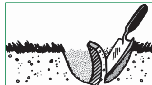
Figure 3. Soil sampling with a trowel.

Push the handle forward, with the spade still in the soil to make a wide opening. Then, as shown in Figure 3, cut a thin slice from the side of the opening that is of uniform thickness, approximately \frac{1}{4} inch thick and 2 inches in width, extending from the top of the ground to the depth of the cut. Collect from several locations. Combine and mix them in a plastic bucket to avoid metal contamination. Take about a pint of the mixed soil and place it in the UGA soil sample bag. Be sure to identify the sample clearly on the bag and the submission form before mailing.