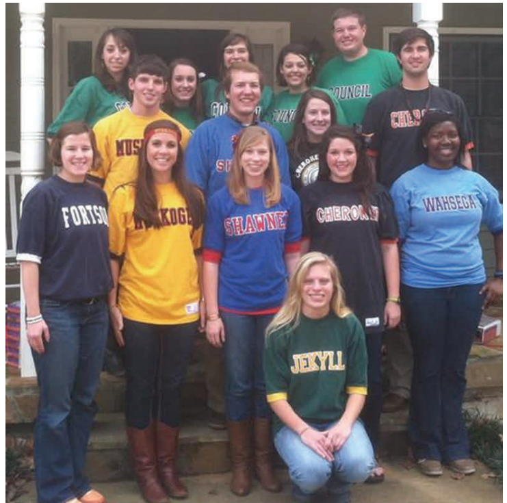
4-H SUMMER CAMP LEADERSHIP COUNSELORS

Sign up will be held Saturday, March 3rd from 8 a.m. to 10 a.m. We could fill up quickly, so be prepared when that time comes. If you missed out on last year's summer camp, you have plenty of time to save some money—so pick up those pine cones, rake those yards, and keep that room clean. Make good grades too. Camp is a one of a kind trip that will have you wanting to stay all summer long. Mark your calendars for sure!! The people on the right want to see you again.