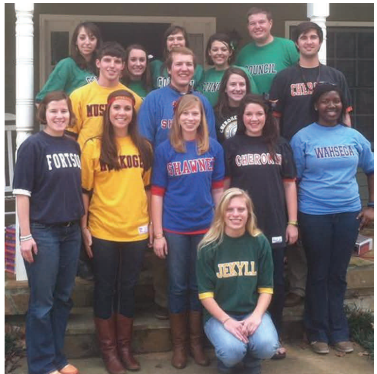
4-H SUMMER CAMP LEADERSHIP COUNSELORS

June 4-8, 2012 at Rock Eagle 4-H Center Cost --$285.00 $95 deposit due at registration Sign up will be held Saturday, March 3rd from 8 a.m. to 10 a.m. We could fill up quickly, so be prepared when that time comes. If you missed out on last year's summer camp, you have plenty of time to save some money —so pick up those pine cones, rake those yards, and keep that room clean. Make good grades too. Camp is a one of a kind trip that will have you wanting to stay all summer long. Mark your calendars for sure!! The people on the right want to see you again.