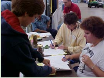
Georgia Master Gardeners