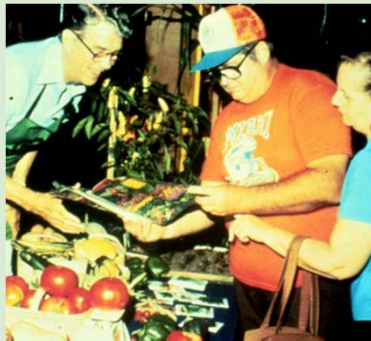
Georgia Master Gardeners