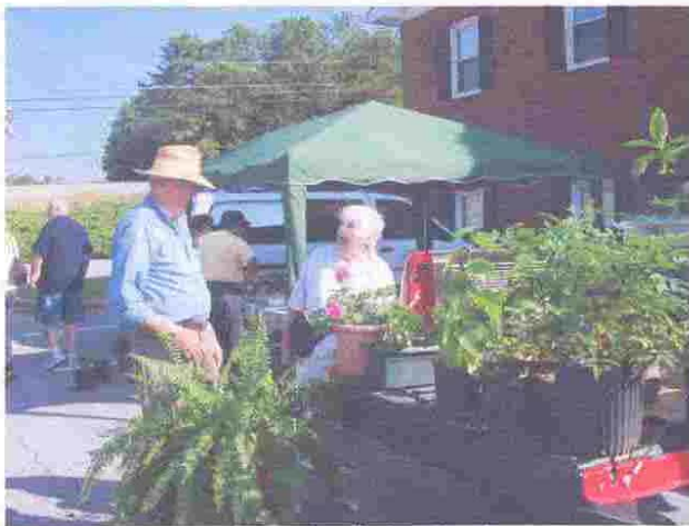
College of Agricultural and Environmental Sciences

Athens THE UNIVERSITY OF GEORGIA AND FT. VALLEY STATE COLLEGE, THE U.S. DEPARTMENT OF AGRICULTURE AND COUNTIES OF THE STATE COOPERATING. The Cooperative Extension Service offers educational programs, assistance and materials to all people without regard to race, color, national origin, age, sex or disability.