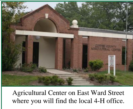
Agricultural Center on East Ward Street where you will find the local 4-H office.

The 4-H office is located in the Coffee County Agricultural Center at 701 East Ward Street. Please use the main entrance at the front or back of the building unless you are coming to an activity in the conference room.