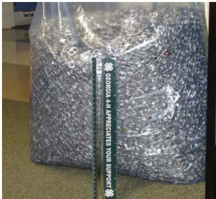
Poptops donated by the Fierce Tigers of Thomas Crossroads