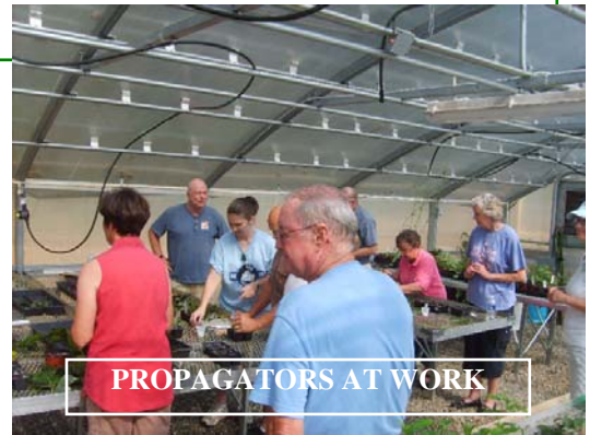
PROPAGATORS AT WORK