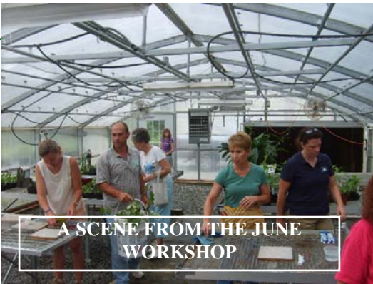
A SCENE FROM THE JUNE WORKSHOP