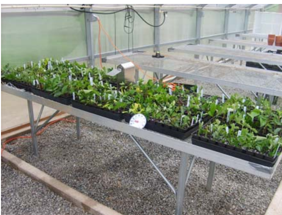
Magic Leaf Misting System