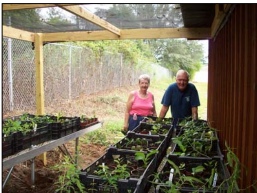
LEFT- Photo 3