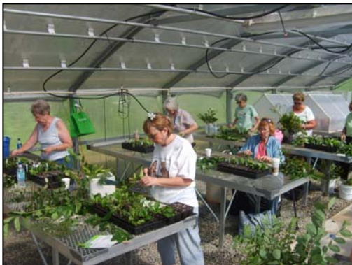
LEFT- Photo 1