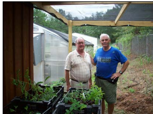
RIGHT- Photo 4