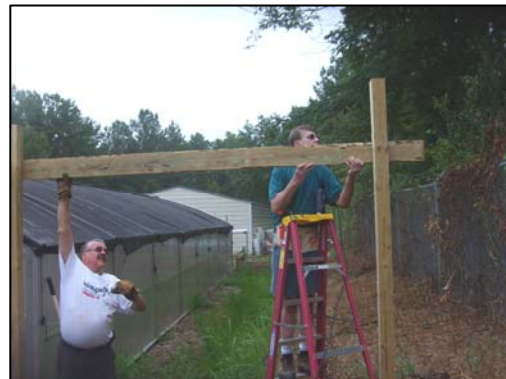
RIGHT- Photo 2