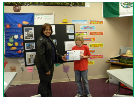
4-H Member receives certificate from extension staff.