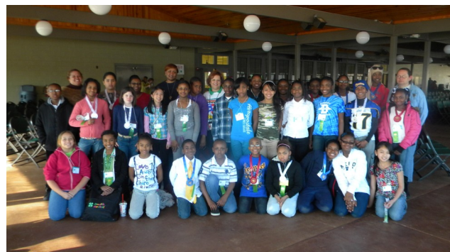
DeKalb 4-H Winners at 2011 Area Project Achievement in Rock Eagle.

4-H is a community of young people across America who are learning leadership, citizenship and life skills .