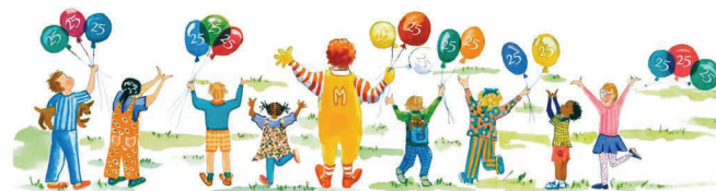
Celebrating 25 Years of Caring for Families!