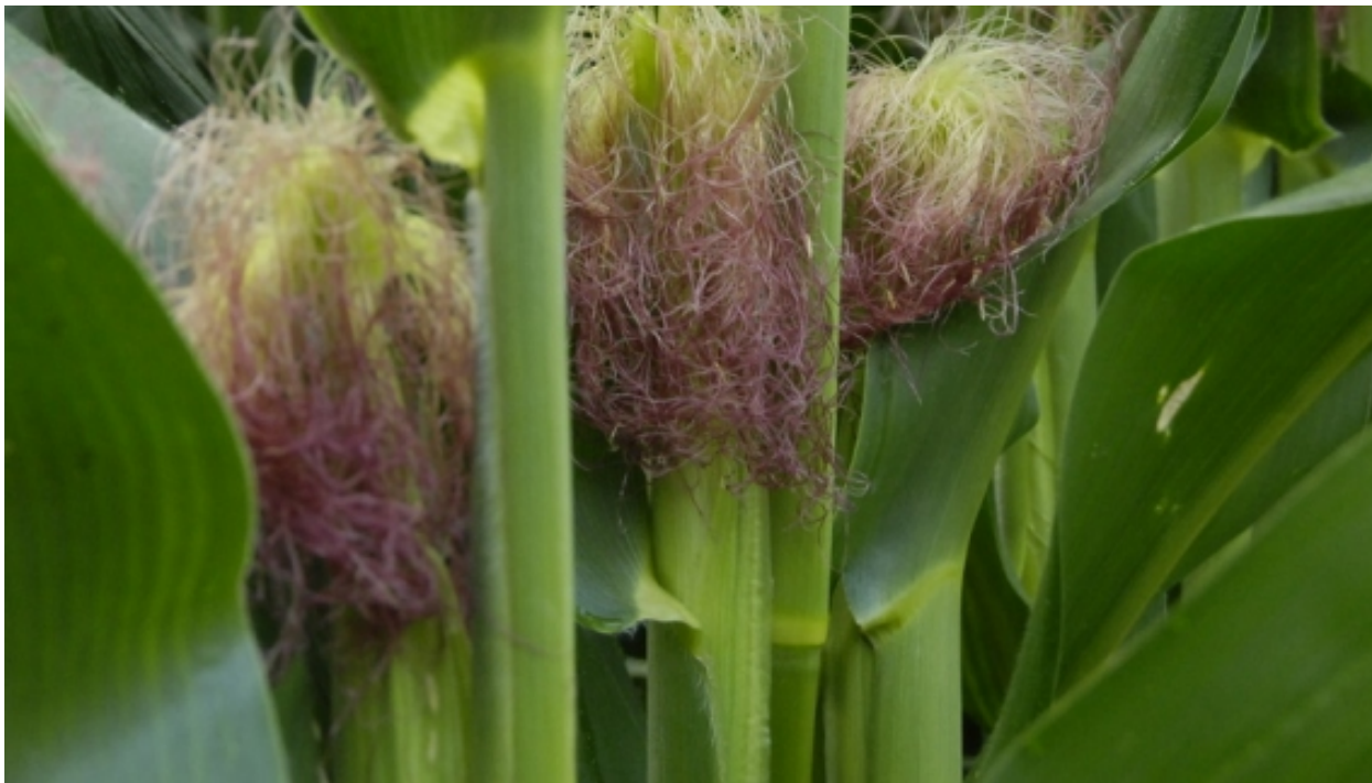
Corn silking with a pinkish purple color to the silks. Now's a critical time to be watching for stinkbugs and plant disease.