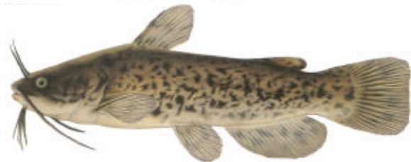
Bullhead picture: Joe Tomelleri